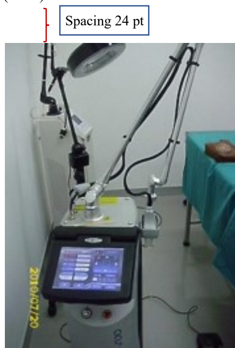
Figure 2.1 CICU RF CO2 Laser Device