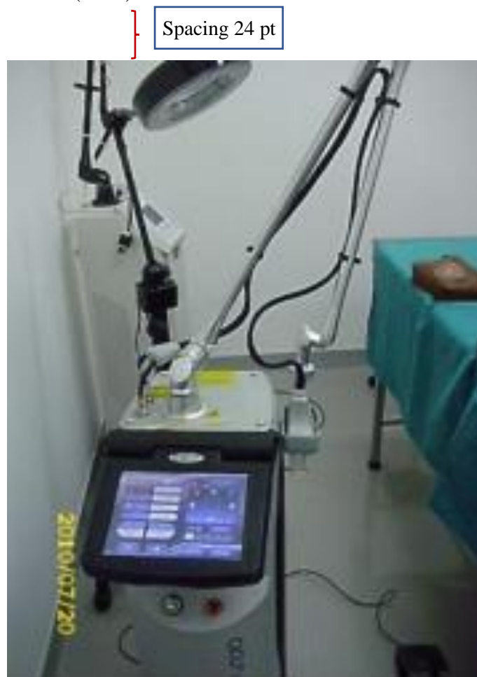
Figure 2.1 CICU RF CO2 Laser Device